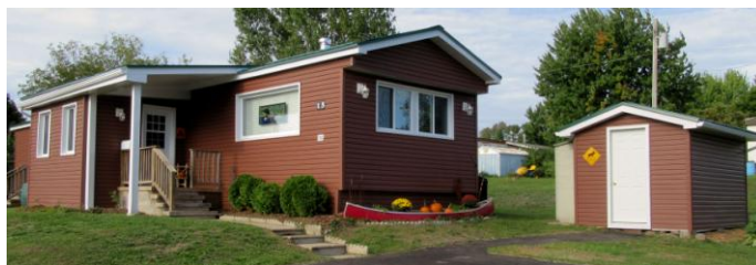
House: after renovations