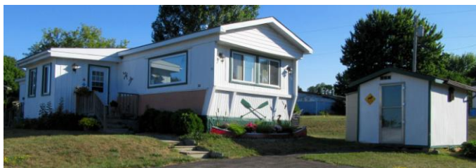
House: before renovations