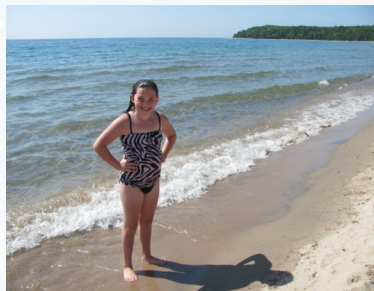
The beach at Pancake Bay