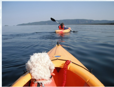
Quiet morning paddle on Agawa Bay