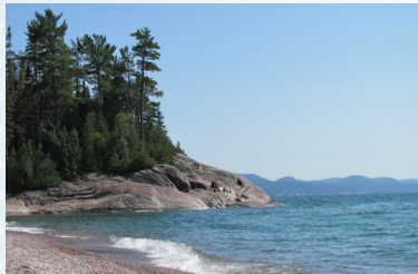
Two views from our site at Agawa Bay!

This past summer, Em and I packed up our dog, bicycles, kayaks and camping gear, and embarked on our fourth trip to the north shore of Lake Superior. We spent a week at an absolutely stunning campsite right on the beach at Agawa Bay, visited the Agawa Pictographs and Town of Wawa, and then thoroughly enjoyed a second week at a nice, little site across the camp road from the beach at Pancake Bay. Here are a few pictures of this wonderful trip: